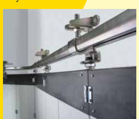
Ryterna technical staff will be happy to share their experience of closing huge size opening. We'll do our best to offer you the most efficient and reasonable solution. Contact us to consult.