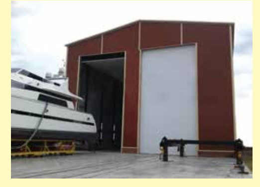
8 x 15 m door. Kazan, Russia