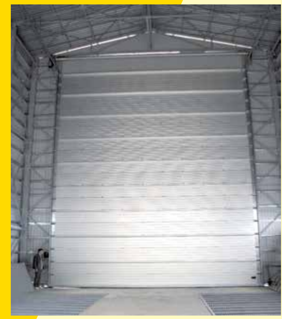
9 x 11 m door in Rokiskis, Lithuania