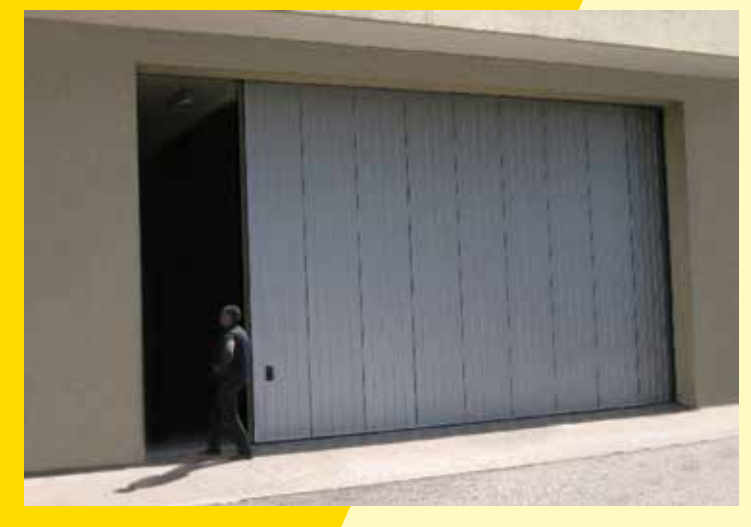
Optional pass door, windows or full vision sections may be installed.

In some special cases, overhead or sliding door can't be installed. Then the swing door may be a solution. This kind of door has a strong frame construction and is covered with insulated panels or other material. Optional pass door or windows may be installed.